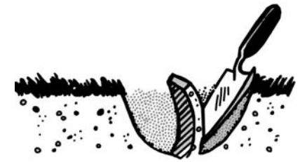
Figure 3. Soil sampling with a trowel.

Use clean sampling tools and containers to avoid contaminating the soil sample. Never use tools or containers that have been used for fertilizer or lime. Collect samples with tools like trowels, shovels, spades, hand probes or hand augers.