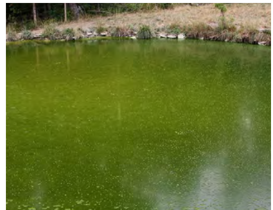
Toxic Algae in Pond

Water is the most important nutrient, but providing clean water is often overlooked. Poor water quality can lead to poor performance and poor reproduction that often goes unnoticed, but that can be deadly as well. Using the best quality of water available will contribute to the optimal production of sheep and goats. Drinking water quality should be part of an evaluation when there is a problem with poor performance and as a general best management practice. The only way to know if a problem exists is to test the water for anti-quality factors.