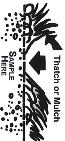
Figure 2. Remove grass thatch or mulch before sampling.