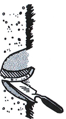
Figure 3. Soil sampling with a trowel.

Use clean sampling tools and containers to avoid contaminating the soil sample. Never use tools or containers that have been used for fertilizer or lime. Collect samples with tools like trowels, shovels, spades, hand probes or hand augers.