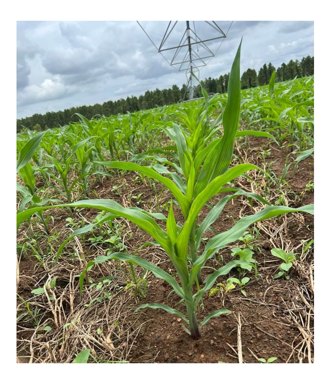
Late Corn after Corn Rome Ethredge