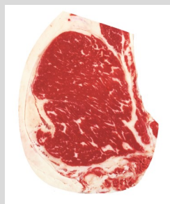
Ribeye Steak Marbling: SLAB QG: Prime