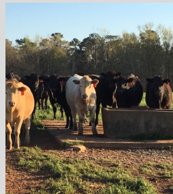
Walters Farm Cattle

“If happiness truly consisted in physical ease and freedom from care, then the happiest individual would not be either a man or a woman; it would be, I think, an American Cow.”