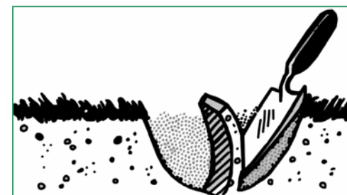
Figure 3. Soil sampling with a trowel.

Push the handle forward, with the spade still in the soil to make a wide opening. Then, as shown in Figure 3, cut a thin slice from the side of the opening that is of uniform thickness, approximately \frac{1}{4} inch thick and 2 inches in width, extending from the top of the ground to the depth of the cut. Collect from several locations. Combine and mix them in a plastic bucket to avoid metal contamination. Take about a pint of the mixed soil and place it in the UGA soil sample bag. Be sure to identify the sample bag and the submission form before mailing.