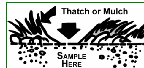
Figure 2. Remove grass thatch or mulch before sampling.

Clear the ground surface of grass thatch or mulch (Figure 2). Using a trowel, push the tool to the desired depth into the soil.