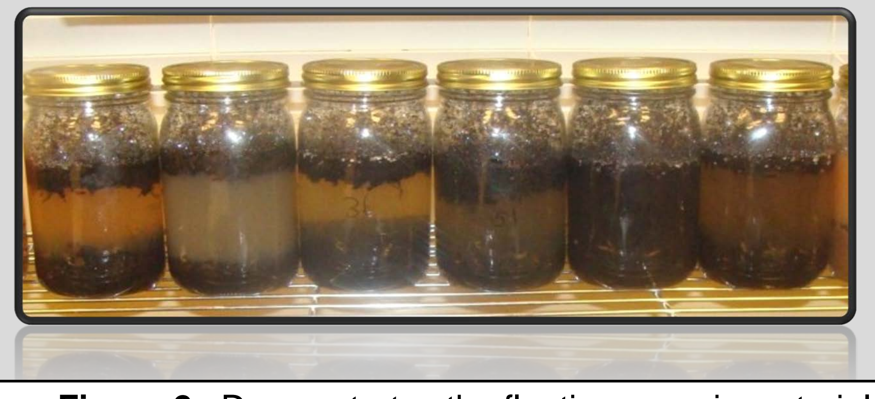
Figure 2. Demonstrates the floating organic material.

Ten gram samples were placed in canning jars and added with 200 milliliters of water, shaken for 5 minutes, and allowed to settle. The thickness of material floating in each jar was compared among each other (see Figure 2).