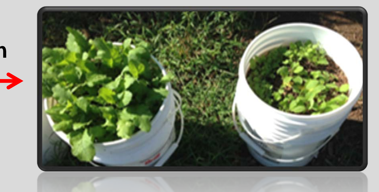
Figure 3. Performance of turnips grown in two garden soils.