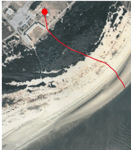
Camp Jekyll 1990