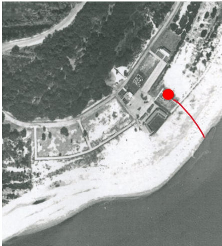
Camp Jekyll 1960