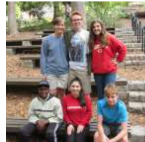
Wildlife Team →