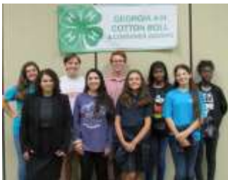
← Consumer Team

We do these competitions every year and we hope that you will consider being part of one of these teams next year.