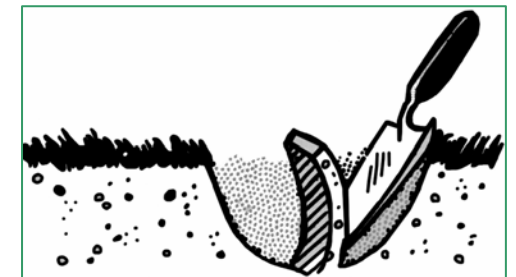
Figure 3. Soil sampling with a trowel.

Push the handle forward, with the spade still in the soil to make a wide opening. Then, as shown in Figure 3, cut a thin slice from the side of the opening that is of uniform thickness, approximately \frac{1}{4} inch thick and 2 inches in width, extending from the top of the ground to the depth of the cut. Collect from several locations. Combine and mix them in a plastic bucket to avoid metal contamination. Take about a pint of the mixed soil and place it in the UGA soil sample bag. Be sure to identify the sample bag and the submission form before mailing.