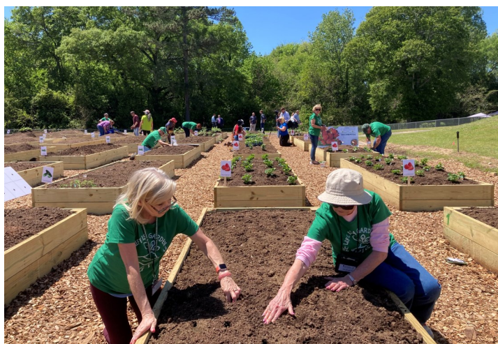
Two Master Gardener volunteers plant vegetables in one of 48 raised garden beds built by students from Rutland High School.