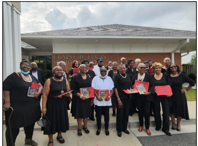
EFNEP Graduation at Elaine Lucas Senior Center

The purpose and mission of the EFNEP program is to reach out to limited-resource families with young children and provide food and nutrition education, using hands-on experiences in a small group setting. Participants attend an eight-lesson series for adults or a six-lesson series for youth, which focuses on stretching food dollars, improving eating habits, and managing food budgets, food preparation, and food safety principles.