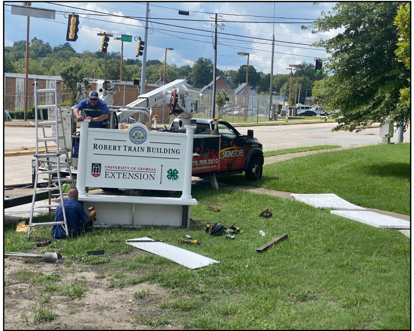
Installation of the UGA Extension/ Robert Train Building sign.

The landscape is the first impression of the building when patrons visit us. Our goal is to incorporate landscape design elements which will include renovation of the patio space, installation of a teaching garden, foundation plantings and overall curb appeal. The landscape project will be among our greatest pursuits at our new location. This generous gift is timely as we approach fall and spring planting seasons.